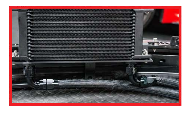
10. Re-install the crash bar to the car.

Install the 90 degree ends of the two oil cooler hoses to the cooler assembly, the short hose should be closest to the crash bar mounting point. Angle the hoses approx 70 degrees from the crash bar.